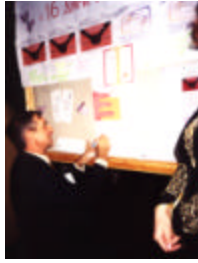
Singing the UNESCO Manifest 2000

1269 people signed the UNESCO Manifest 2000 “In Support of World Culture Without Violence”.