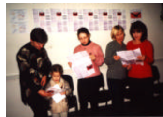
After the training

For youth, 18 interactive discussions were organized and held on the topics “My Choice—Life Without Violence” and “Life Abroad: Myths and Reality”, in which more than 1486 people participated.