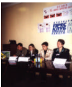
During the press-club

A 30-minute television program “ Women for Women ”, which was produced with the financial support of the Open Society Institute, focused on prevention of violence and trafficking of women and was aired four times. These problems were also highlighted in the television program “ Youth Corridor ”, the video “ In Search of Lost Happiness ”, and in the radio program “ Saturday Talk ”, airing on regional television and radio stations. Informational spots were also aired on local television and radio channels. Total air-time devoted to this topic was 4 hours, 36 minutes on television and 2 hours, 27 minutes on radio. An estimated 2,059,800 people were reached in the Donetsk area and surrounding cities.