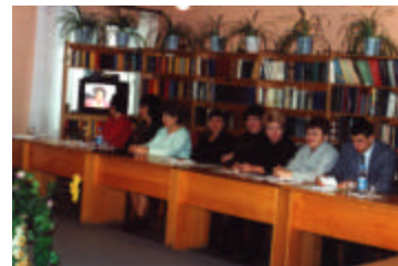
Informational round-table in Nosyolovka

The DRLBPW and Winrock International also held 85 training programs on the topic “My Choice—Life Without Violence”, “Life Abroad: Myths and Reality”, “Women’s Human Rights”, “Women’s Leadership”, “I Will Get A Job”, and “Women’s Business—Successful Business”, in which 1,685 girls and women participated. Various courses in the “Women for Women” center were held for 134 groups consisting of 1,604 girls and women.