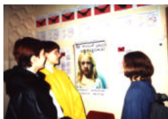
Before the training

The DRLBPW and Winrock International also held 85 training programs on the topic “My Choice—Life Without Violence”, “Life Abroad: Myths and Reality”, “Women’s Human Rights”, “Women’s Leadership”, “I Will Get A Job”, and “Women’s Business—Successful Business”, in which 1,685 girls and women participated. Various courses in the “Women for Women” center were held for 134 groups consisting of 1,604 girls and women.