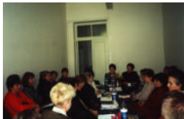
Informational round-table in Donetsk

Upon the initiative of the DRLBPW and with financial support from Winrock International , 23 informational round tables were held on the topic: “Social Partnership of Community Organizations and State Structures in Resolving the Problems of Prevention of Violence and Trafficking of Women”. 883 people participated in these including representatives of media, representatives from various government agencies and administrations, educational institutions, medical organizations, legal rights organizations, non-governmental organizations, libraries and others. Round tables were held in 12 cities and villages in the region. They were often combined with training programs, lectures, videos and appearances by local specialists. Four round tables, involving 91 people were specifically held for public officials, certain educational institutions, and area journalists.