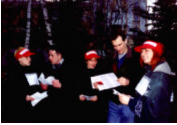
During the informational campaign in the city of Donetsk

139 volunteers of the League distributed 2000 posters and pamphlets and about 10,000 press-releases all over Donetsk city and the region. Twenty-seven cities and villages also supported the campaign.