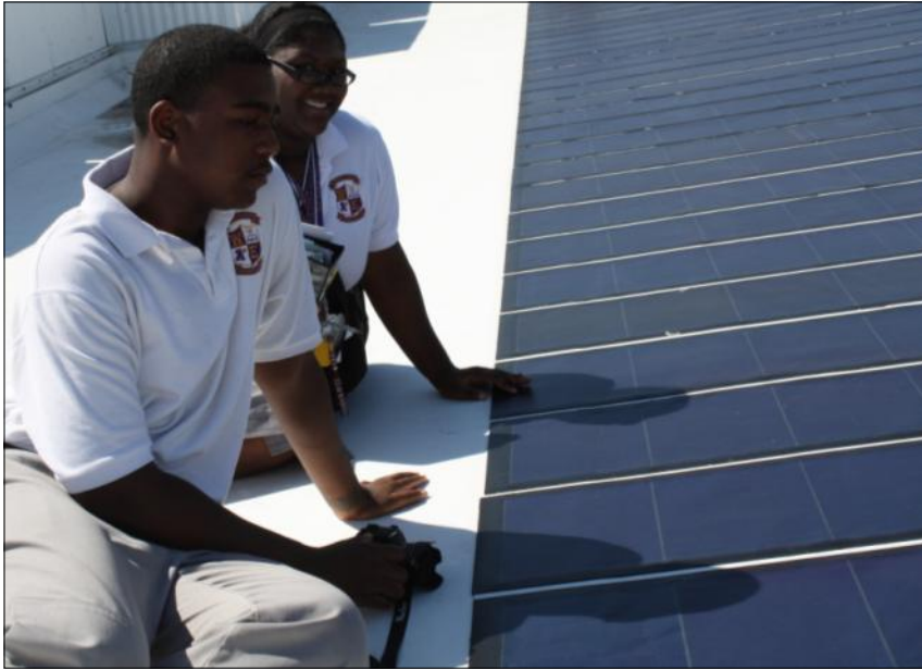
Warren Easton school students nearby one of the solar panels at their school's rooftop.

Improving Lives and Livelihoods Worldwide